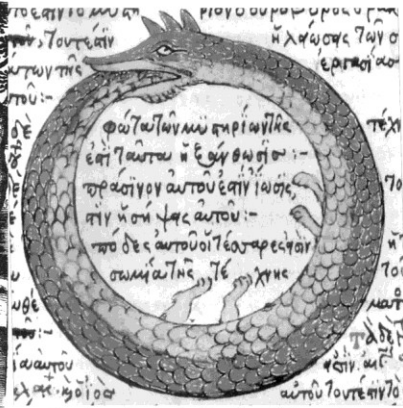
Ouroboros drawing by Theodoros Pelecanos in an alchemical tract entitled Synosius (1478)

Ouroboros symbolism has been used to describe Kundalini energy. According to the second century Upanishad , Hindu religious texts, "The divine power, Kundalini, shines like the